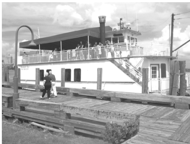
Boat and Dock

We made reservations for 40 people but the owner says that he can accommodate more if we let him know in advance. He has to have a firm count before ordering the food. We will be the only people on board, so he can accommodate up to a total of 60 people.