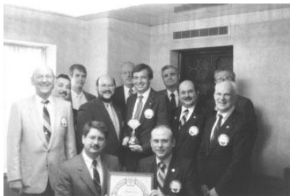
San Antonio Masonic High Twelve Club #656 Charter Meeting in San Antonio-4-26-1987