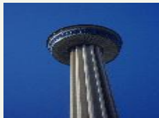
See you in San Antonio

Happiness is a Journey and a Destination