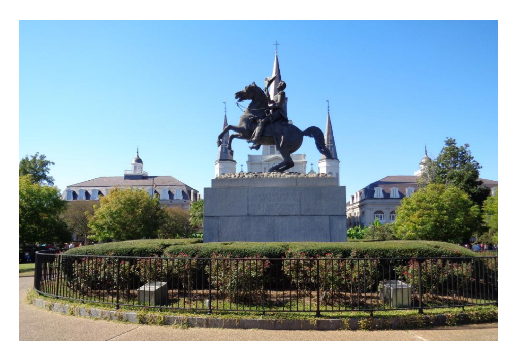
Figure 2. Jackson Square in the Vieux Carre

I walked quickly to Jackson Square (see Figure 2) and had beignets at the Café Du Monde. (See Figure 3) They say if you sit at the Café Du Monde long enough the whole world comes to you.