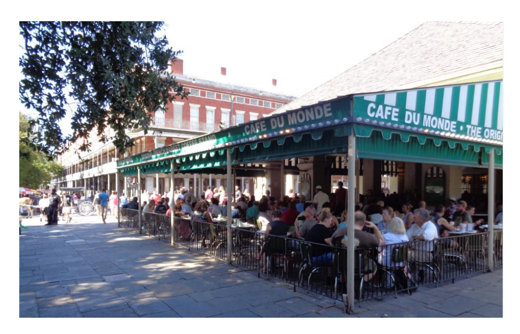
Figure 3. Café Du Monde on the Mississippi River Bank

I walked quickly to Jackson Square (see Figure 2) and had beignets at the Café Du Monde. (See Figure 3) They say if you sit at the Café Du Monde long enough the whole world comes to you.