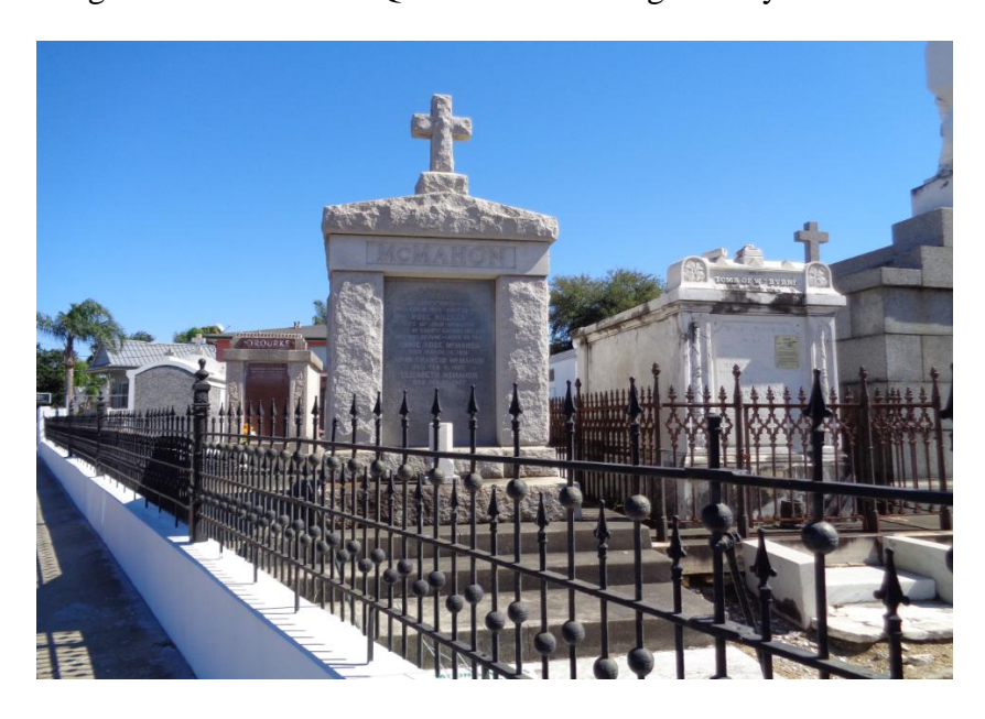
Figure 7. New Orleans Cemetery

Exciting tours abound throughout the French Quarter and the city. Cemetery tours of the old above ground mausoleums are one the favorites. (See Figure 7) Since New Orleans is six feet below sea level burials have to be above ground or the water pressure will push caskets up out of the ground. The French Quarter was the original city site and had the only land over the water.