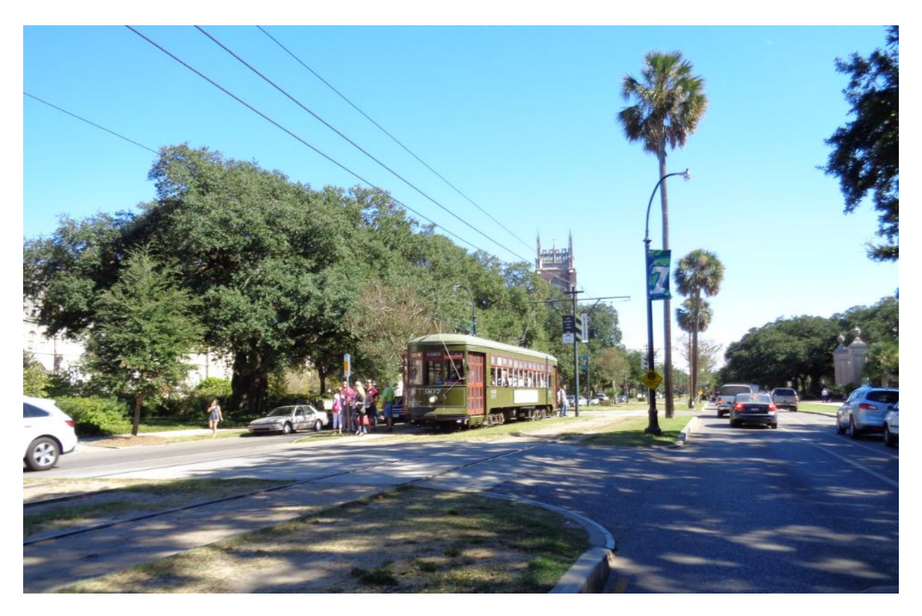
Figure 8. New Orleans Streetcar on St. Charles Avenue in front of Tulane and Loyola Universities and Audubon Park and Audubon Zoo in the Uptown District

The streetcars are available nearby our hotel to take you uptown to ride and look at the beautiful homes, overhanging ancient trees and exciting activities up and down the trolley car rails from the French Quarter across the city. (See Figure 8) A list of interesting New Orleans' websites and a list of restaurants within walking distance of the Maison Dupuy Hotel follow for your information. Cindy Kass (see Figure 9) is our hostess contact at the Maison Dupuy Hotel. Please feel free to call her directly if you have any questions about your travel or stay at the Maison Dupuy Hotel. The President and all the officers at High Twelve International (HTI) look forward to seeing you in New Orleans and we encourage you to make your reservations in this popular sell out city early.