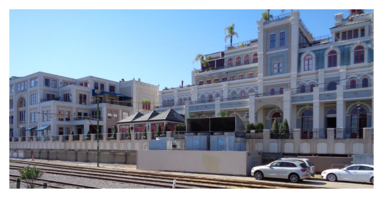
Figure 5. Jackson Brewery Shopping Center on the Mississippi River in Front of the Natchez

The view to the immediate right shows the Jackson Brewery Center which has been converted from the old Jax Beer Brewery to a riverside shopping mall by the St. Louis Cathedral. (See Figure 5)