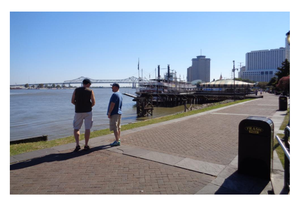
Figure 4. Natchez Paddleboat on Mississippi River behind Café Du Monde

Then I walked behind Café Du Monde and looked at the Mississippi River and the Natchez moored there. The suspension bridge across the river goes from New Orleans to the west bank which is on the east side of New Orleans due to its unique crescent shaped waterway curve.