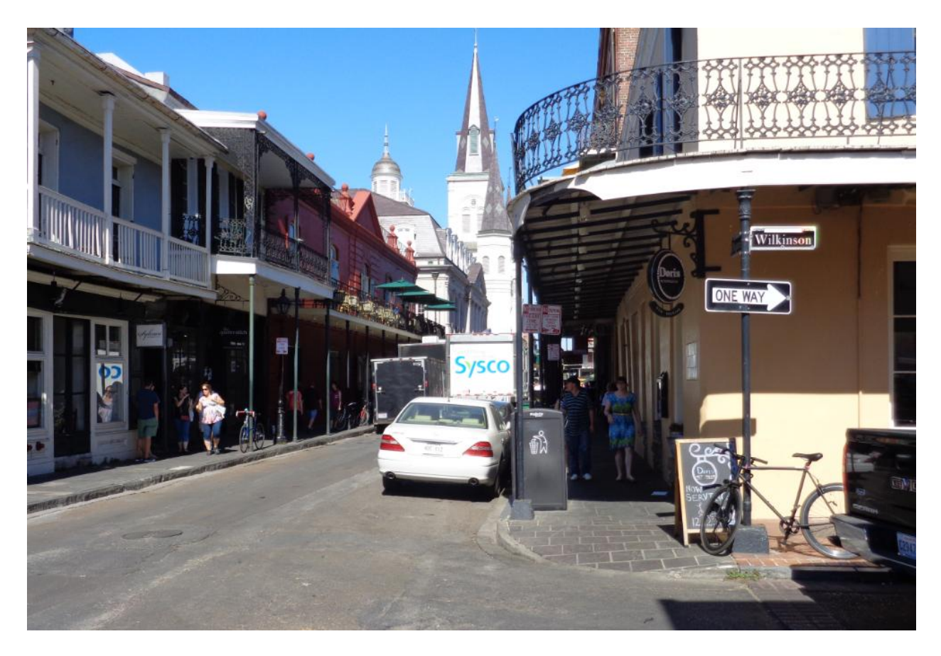
Figure 10. Rue Wilkinson Runs One Block Only in Front of the Old Jax Beer Brewery

Rue Wilkinson is a one block only street one block away from the St. Louis Cathedral by Jackson Square and in front of the old Jax Brewery. The Mississippi River is on the other side of the Jackson Brewery at the foot of Wilkinson Street. My family line members only needed one block to leave our name by the Jax Brewery and in French Quarter history. (See Figures 10 and 11)