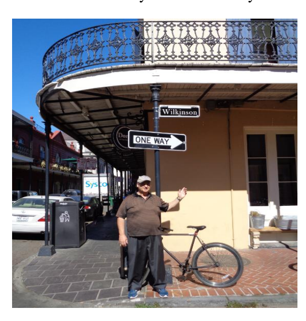
Figure 11. Rue Wilkinson, Vieux Carre

Rue Wilkinson is a one block only street one block away from the St. Louis Cathedral by Jackson Square and in front of the old Jax Brewery. The Mississippi River is on the other side of the Jackson Brewery at the foot of Wilkinson Street. My family line members only needed one block to leave our name by the Jax Brewery and in French Quarter history. (See Figures 10 and 11)