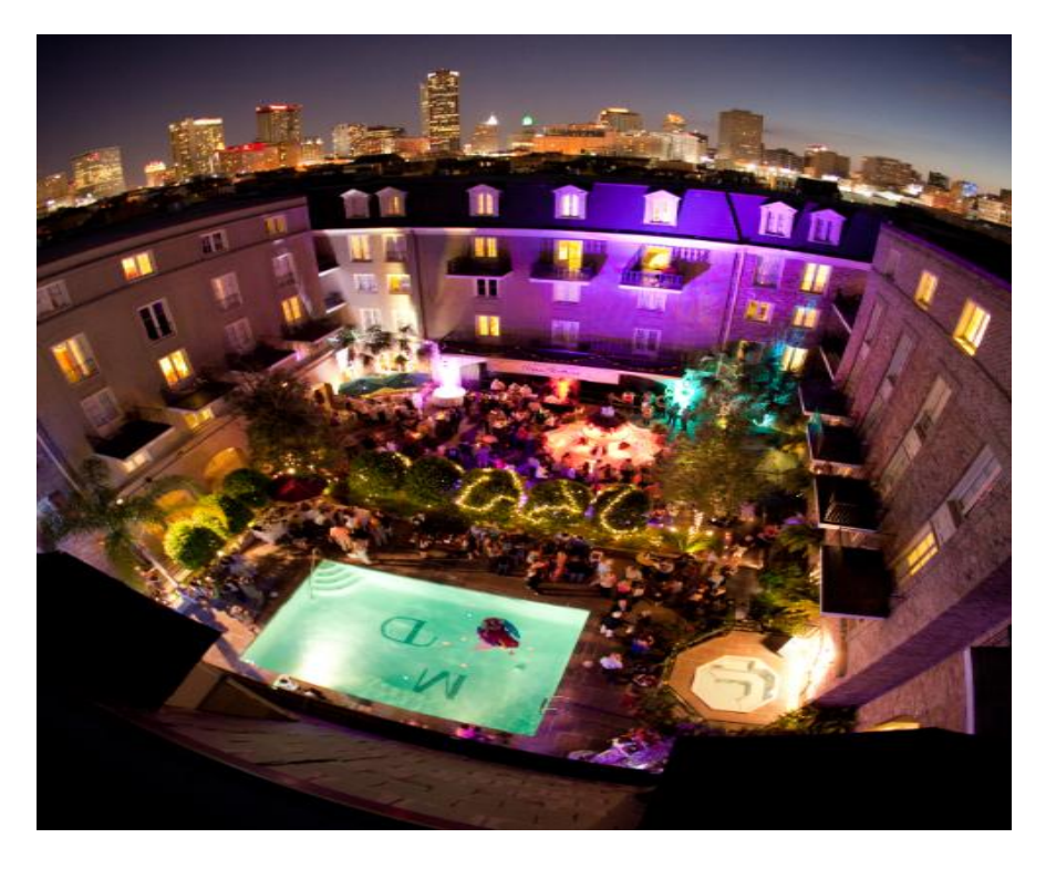
Figure 1. Maison Dupuy Courtyard and New Orleans

I flew to New Orleans to preview our hotel and the sites for our January meeting. Here is what I found. We are staying at the world-class Maison Dupuy Hotel in the heart of the French Quarter. The hotel website is at <a href="www.maisondupuy.com">www.maisondupuy.com</a>. You can view a picture from the Maison Dupuy Hotel overlooking the city of New Orleans at night. (See Figure 1) The hotel is newly renovated and built in the courtyard style of the historic French Quarter. We have 40 great rooms held for you that always fill up months ahead at $500-$600 a night for only $129 – reserve yours early.