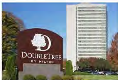
Doubletree of Overland Park KS.

Overland Park Kansas. Call them at 913-451-6100 and mention High Twelve for a rate of $ 119.00 per night. A block of rooms has been set aside for our use until May 28 th , 2022. Reservations after that date will be at the prevailing rate.