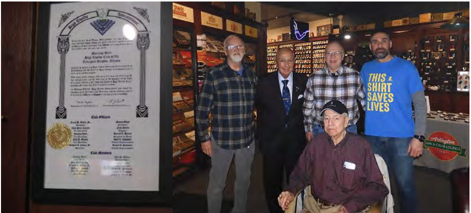
Officers (Left to Right)

We meet at a cigar lounge, where else, in Arlington Heights Illinois .