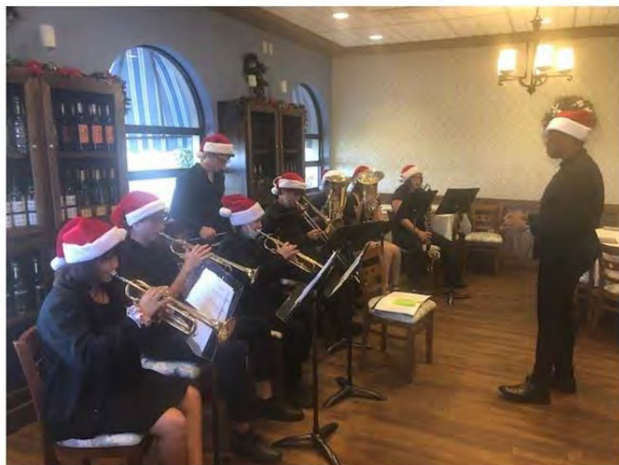
Musical entertainment for December was provided by Wildwood Middle High school ensemble. There were several solos, duets and the full group performed several Christmas favorites. The band Director was presented with a Club donation for their Music program.