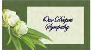
Des Moines High Twelve Club No. 4