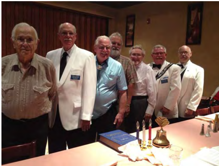
Photo below of the Cochise High 12 Club Installation - Club officers and Installing Officers.

California High Twelve Association, Fresno High Twelve Club #10, Fresno, CA: Well... here I am the beginning of a new Masonic Year with High Twelve. I find myself your President for the year, wondering how I will fair in the position. I have a fine team of officers to support me but still lack a couple of key positions.