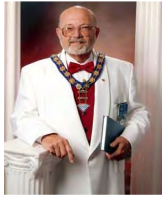
Passed on Friday October 23, 2020 after a short bout with cancer.