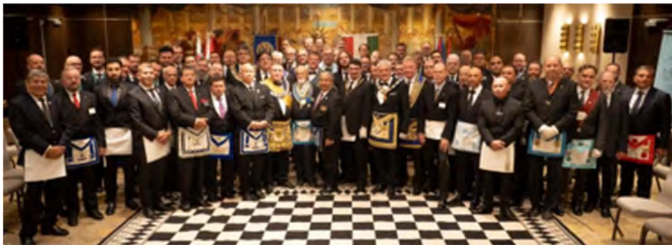
Budapest, Hungary, Masonic Lodge