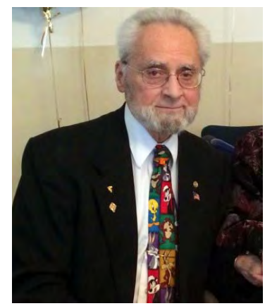
August 31, 1935 ~ October 16, 2016

<u>Publication Update</u>: Brethren, beginning in the month of December 2016, the Monthly Update will be published about the 10th of each month. Many articles submitted come from the Trestle Boards of the Lodges and Association Newsletters. We have been attempting to publish by the 1st of each month but the articles are submitted just after the 1st, so many of the articles are news or information from the previous month.