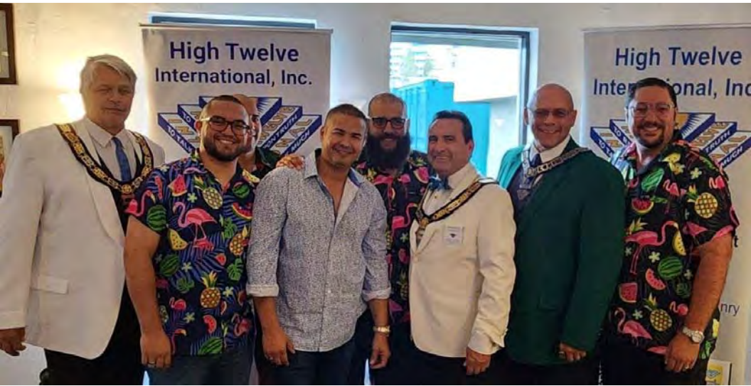
Miami High Twelve Club #796 Installation of Officers August 1, 2022