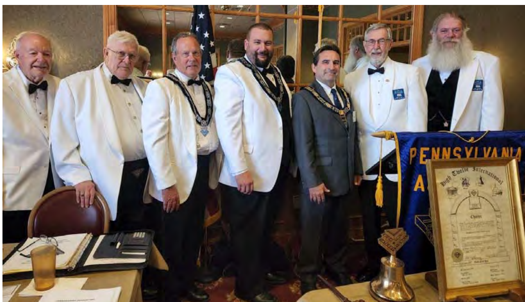
Pennsylvania State High Twelve Quarterly Meeting Held on August 22, 2022