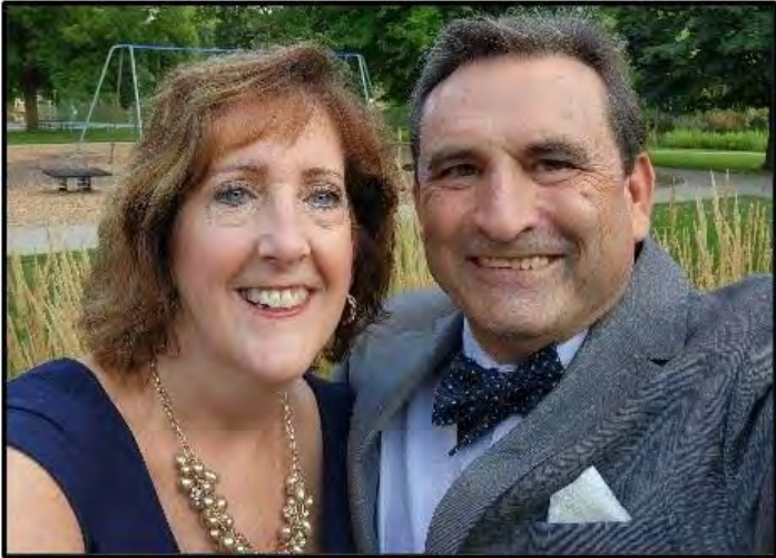
We celebrated my daughter's wedding in Appleton WI