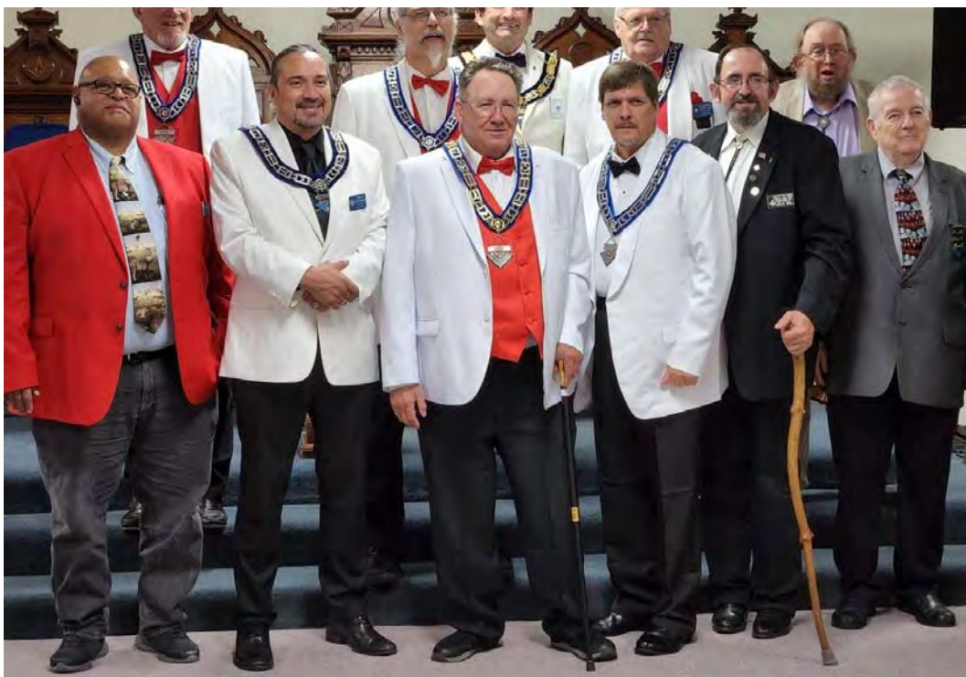
Illinois State Association Annual Meeting and Installation