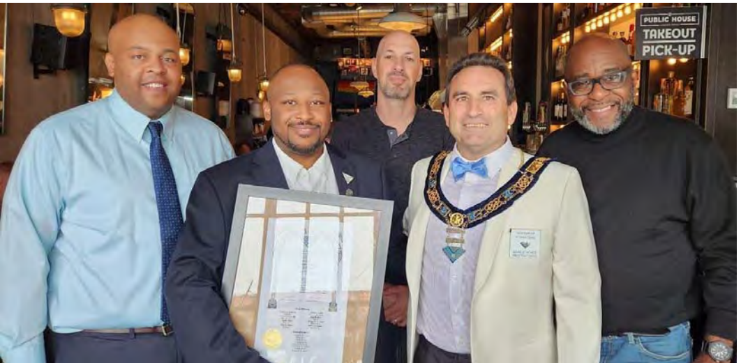
Abiff Tri-City High Twelve Club #799 Detroit, Michican Charter Presentation September 24, 2022