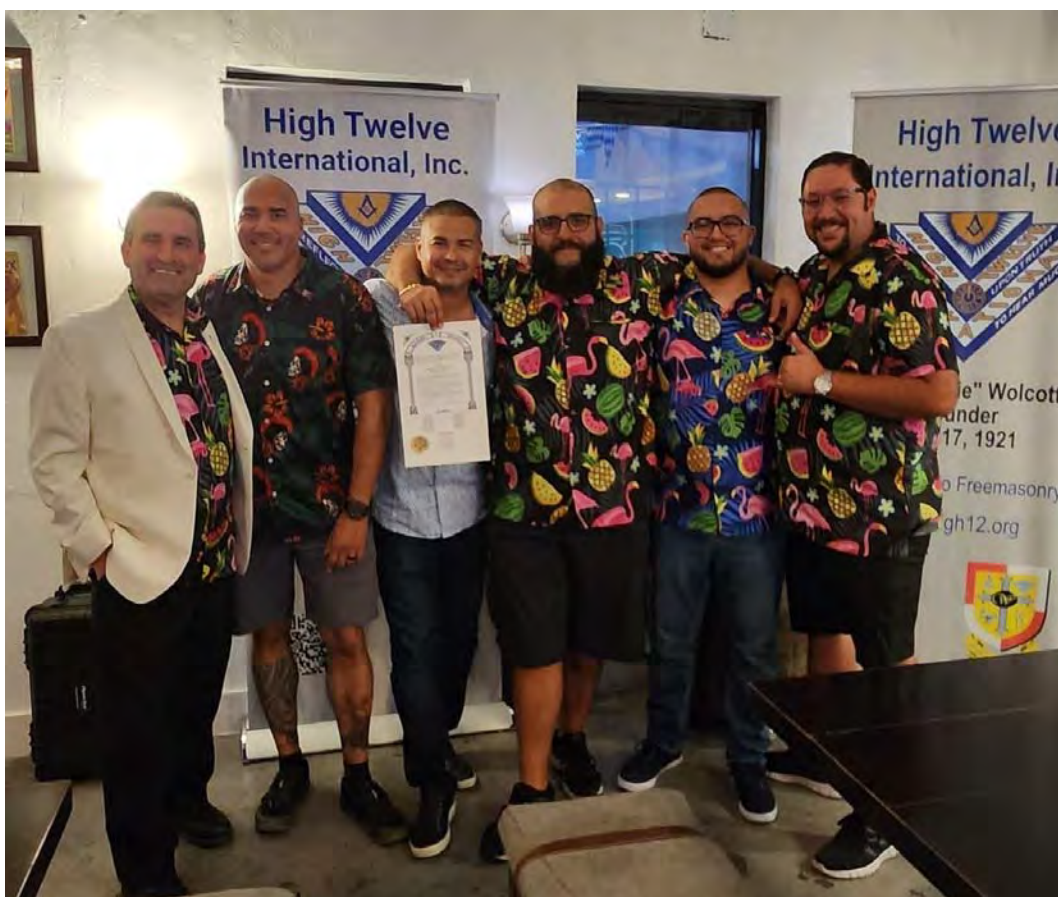
Miami High Twelve Club #796 - Miami Florida Chartered August 1, 2022