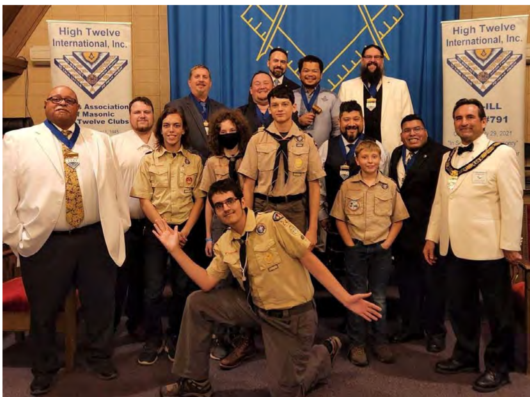
CHI-ILL High Twelve Club #791 Installation of New Officers