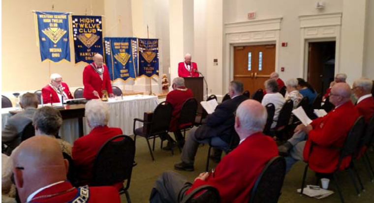
Ohio State Convention

I encourage everyone to focus on Number 1 above. I hope to see many of you during my travels. Stay safe, have fun and watch out for each other!