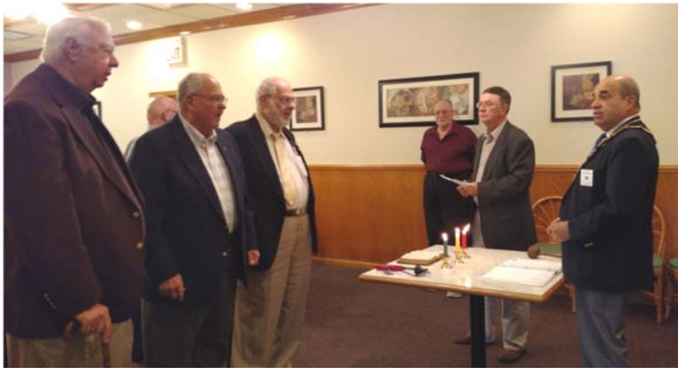
Middle Chamber #725 Installation of Officers on October 4, 2016 [L-R]